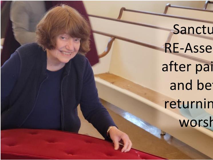
Sanctuary RE-Assembly after painting and before returning for worship