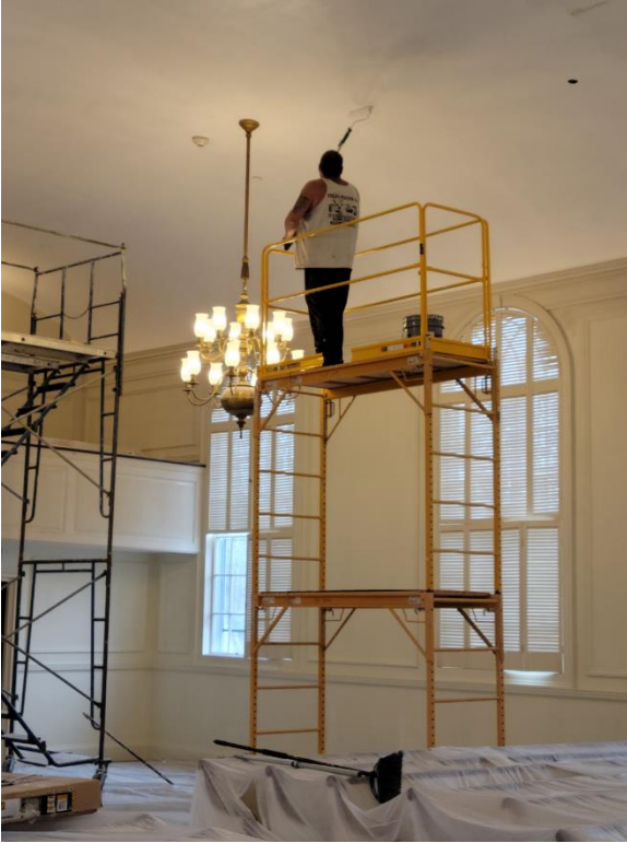
Field's Painting Middleton MA