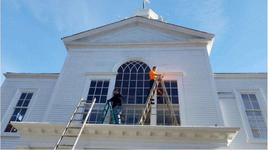
The Cooper Group restored the balustrades. Portanova Roofing rebuilt the portico roof and installed them.