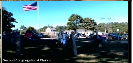
Second Congregational Church