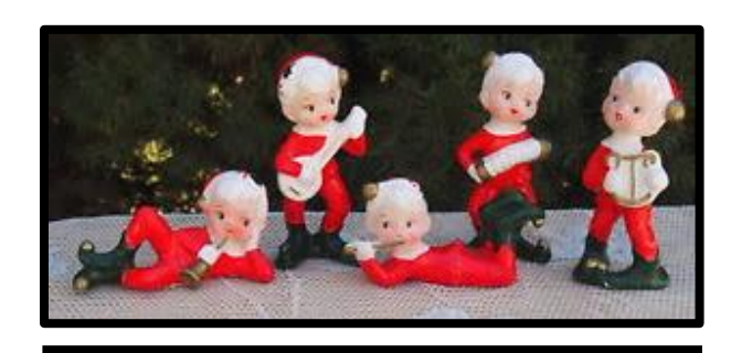
Calling all SCC Elves!

Believe it or not it's that time of year when you should get a jingle in your step and start working on things for the 2020 Village Fair. I'm hoping that many of you are working on "your one of a kind" project. These winter months are the perfect time to do it before Spring arrives and you find yourself outside working in the garden and planning summer vacations.