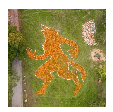
Created by Phil Lehr!