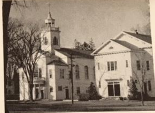
At left the Town Hall and Second Church as they appeared up to the mid-twenties, and at right as they appear today. The Town Hall was rebuilt in 1925, the church after it was ravaged by fire in 1927.